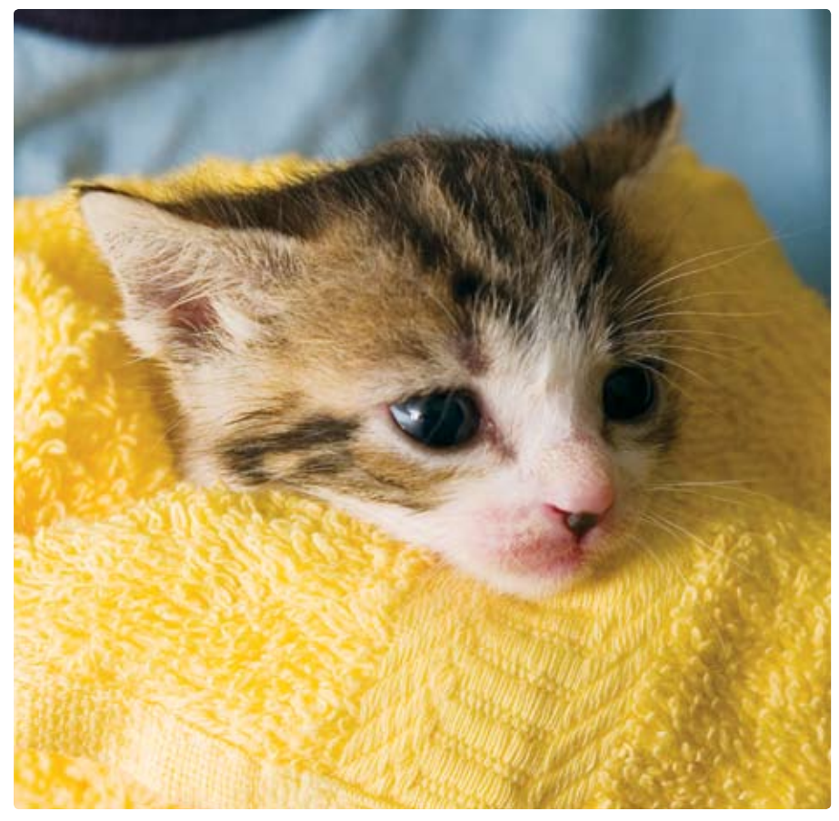
Humid environments and excessive bathing can predispose cats to ringworm infection.

may cause large areas of alopecia, with or without scaling or with broken, frayed hairs. The primary disease does not normally cause pruritis (itching), although this may sometimes be seen. Lesions may be symmetrical, and the skin may be reddened. Lesions often appear on the face, head, ears, paws (especially the nailbeds), forelimbs, and tail. Ringworm may be implicated in other skin diseases such as feline acne (found on the chin) or "stud tail" (the term describing an accumulation of greasy secretions from glands located at the top of the tail).